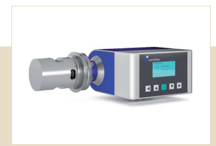
Fig. 2 High precision CO, sensor (CARBOTEC)